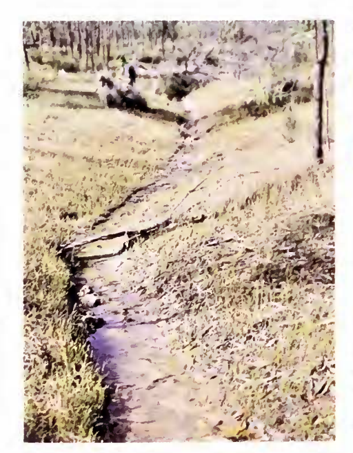
Typical habitat of Byblis liniflora . This was photographed at the end of the wet season. A few months late this area would be dry and no plants of Byblis would be visible.

B. liniflora is a plant of sandy situations, usually in areas which are moist for at least part of the year. The climate over northern Australia is monsoonal with a wet season in the hot part of the year from about December to April. The remainder of the year ranges from dry to very dry and remains warm to hot even in winter. B. liniflora is abundant around soaks or seasonal water holes, usually in areas at least partly shaded by herbs or larger plants. In permanently moist situations this species may be a perennial, but in areas subject to drying out it is more commonly an